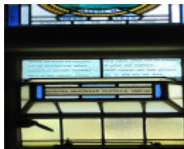
Crib Point HMAS Cerberus Anglican Chapel N Class Destroyers (2)