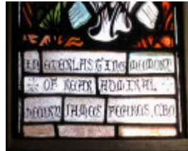
Crib Point HMAS Cerberus Anglican Chapel Feakes (2)