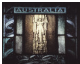
Geelong Grammar School _0002