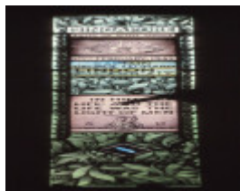
Corio Geelong Grammar School Lindon