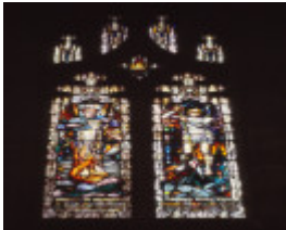
Corio Geelong Grammar School Chapel_ Michael and Uriel