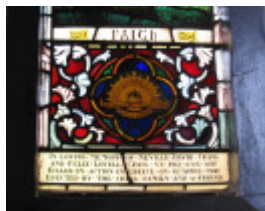
Ararat Holy Trinity Anglican Church, Faith inscription, Mathieson & Gibson 1944