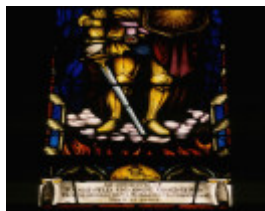
Oakleigh St Michael detail