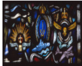
South Yarra Melbourne Boys High School War Memorial 1956_0001