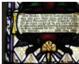
South Melbourne St Paul Uniting Joshua inscription 2