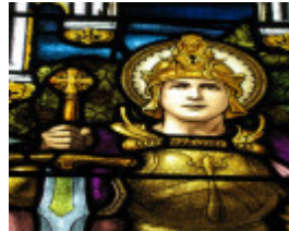
Balwyn St Barnabas Anglican Church, Fortitude detail, Brooks, Robinson & Co.1919