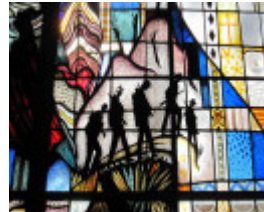
Mordialloc St Brigid's Catholic Church