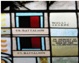
Mordialloc St Brigid's Catholic Church (8)