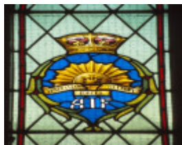
Hawthorn St Columbs Anglican WWII C1950 detail