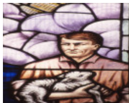
Goornong St Georges Anglican AIF Goldie detail