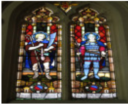
Essendon St Johns Uniting David and Jonathan