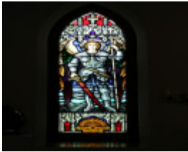
St Helena St Katharines