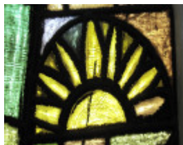
Mildura St Margarets Anglican Church Philbrick memorial detail