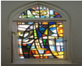
Mildura St Margarets Anglican Church Henshall memorial