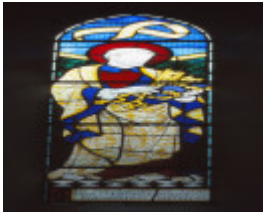
Camberwell St Mark's Anglican Church, St. Peter, Ninian Comper c. 1958