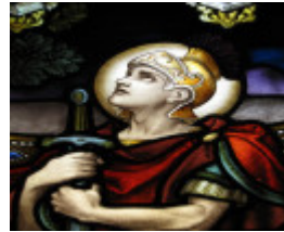
Myrtleford St Pauls Church Faith in Armour detail 1