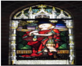
Myrtleford St Pauls Church Faith in Armour