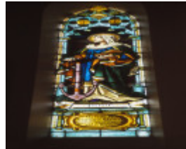
Ballarat St Peters Anglican Church