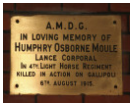
Parkville Trinity College Chapel Moule plaque RB