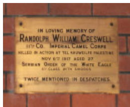
Parkville Trinity College Chapel Cresswell plaque RB