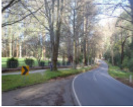
T12208 Fagus sylvatica