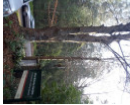
T12208 Fagus sylvatica