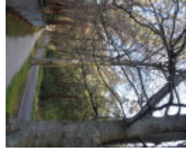
T12208 Fagus sylvatica