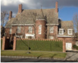
22 St Georges Road, Toorak