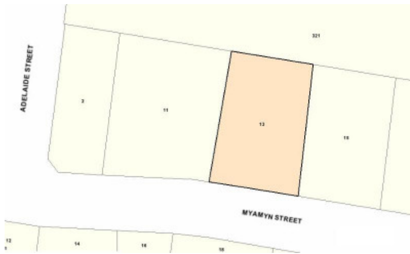
Recommended extent of heritage overlay at 13 Myamyn Street, Armadale.