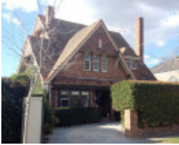
13 Myamyn Street, Armadale