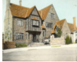
2 Ledbury Court, c1930.