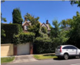
221 Kooyong Road, Toorak