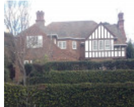
221 Kooyong Road, Toorak