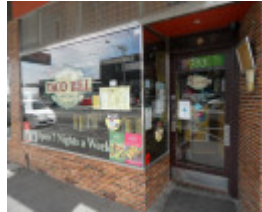
349-355 Keilor Road