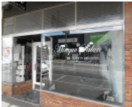
349-355 Keilor Road