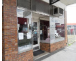
349-355 Keilor Road