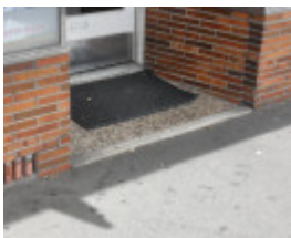
349-355 Keilor Road