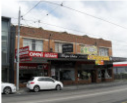
349-355 Keilor Road