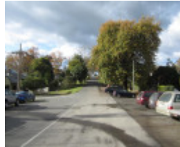
Symons St, looking east from the intersection with Crowley Rd/Green St. The street climbs towards Manse St. Note the mature trees at right.