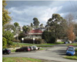
Intersection of Symons St and Crowley Road, Green Street, looking south- west. 28 Symons St (significant ) is prominently sited at centre of image.