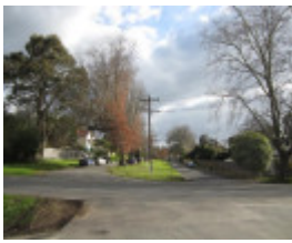
Symons St looking west from Crowley Rd, Green St showing the centre verge with its mature tree plantings and sloping topography. 24 Symons St (contributory) is at left.