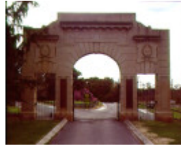
1 white hills botanic gardens arch