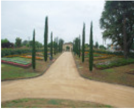
WHITE HILLS BOTANIC GARDENS SOHE 2008