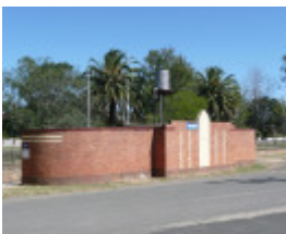
PRINCE'S PARK SOHE 2008