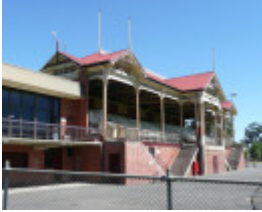
PRINCE'S PARK SOHE 2008