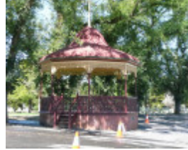
PRINCE'S PARK SOHE 2008