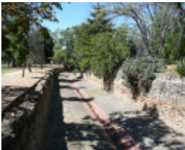
PRINCE'S PARK SOHE 2008