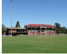
PRINCE'S PARK SOHE 2008