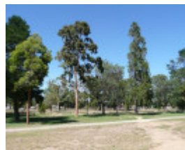
PRINCE'S PARK SOHE 2008