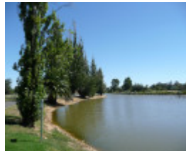
PRINCE'S PARK SOHE 2008