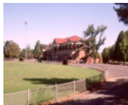
1 princes park park march2000 jh