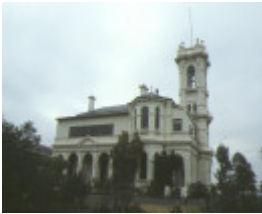
frognall mont albert road canterbury side elevation