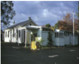
frognall mont albert road canterbury weatherboard buildings