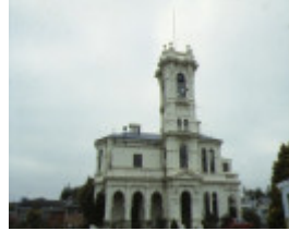
1 frognall mont albert road canterbury front view