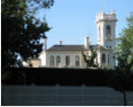
FROGNALL SOHE 2008