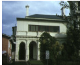
frognall mont albert road canterbury side view