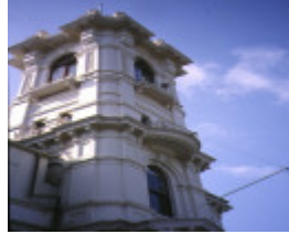
frognall mont albert road canterbury detail view of tower