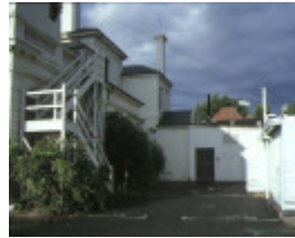
frognall mont albert road canterbury side stairway