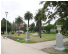
JOHNSTONE PARK SOHE 2008