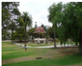
JOHNSTONE PARK SOHE 2008