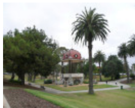
JOHNSTONE PARK SOHE 2008