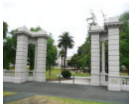
JOHNSTONE PARK SOHE 2008