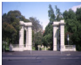
1 johnstone park geelong memorial gates