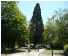
HEPBURN MINERAL SPRINGS RESERVE SOHE 2008