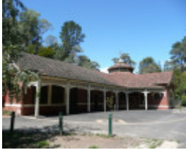
HEPBURN MINERAL SPRINGS RESERVE SOHE 2008