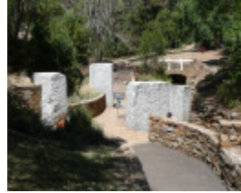
HEPBURN MINERAL SPRINGS RESERVE SOHE 2008