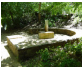
H2098 Hepburn Mineral Springs reserve_soda_springs_Nov.05