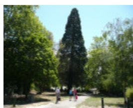
HEPBURN MINERAL SPRINGS RESERVE SOHE 2008