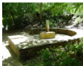
H2098 Hepburn Mineral Springs reserve_soda_springs_Nov.05