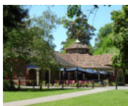
H2098 Hepburn Mineral springs reserve _Pavillion_Nov.05