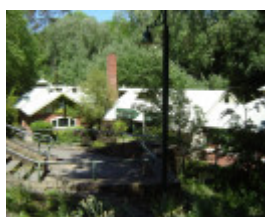
H2098 Hepburn Mineral Springs Reserve_bathhouse_Nov.05