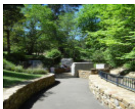
H2098 Hepburn Mineral springs reserve_locarno_spring_Nov.05