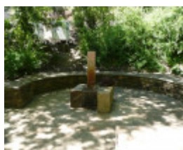
HEPBURN MINERAL SPRINGS RESERVE SOHE 2008