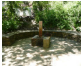
HEPBURN MINERAL SPRINGS RESERVE SOHE 2008