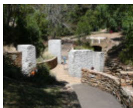
HEPBURN MINERAL SPRINGS RESERVE SOHE 2008