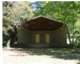
HEPBURN MINERAL SPRINGS RESERVE SOHE 2008