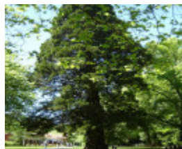
H2098 Hepburn Mineral Springs reserve_sequoiadendron_Nov.05