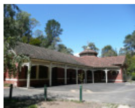
HEPBURN MINERAL SPRINGS RESERVE SOHE 2008