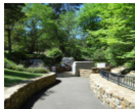
H2098 Hepburn Mineral springs reserve_locarno_spring_Nov.05