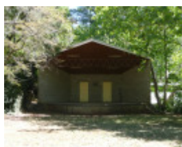
HEPBURN MINERAL SPRINGS RESERVE SOHE 2008