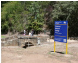
HEPBURN MINERAL SPRINGS RESERVE SOHE 2008