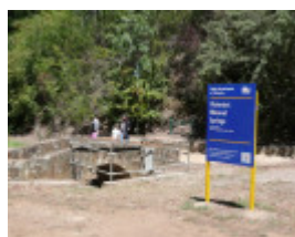
HEPBURN MINERAL SPRINGS RESERVE SOHE 2008