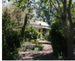
HEPBURN MINERAL SPRINGS RESERVE SOHE 2008