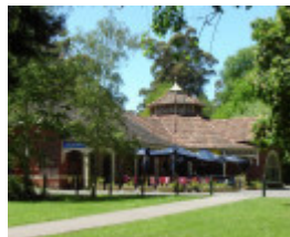
H2098 Hepburn Mineral springs reserve _Pavillion_Nov.05