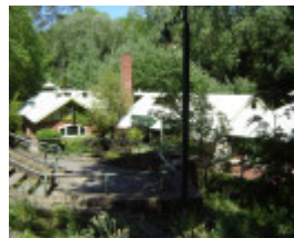
H2098 Hepburn Mineral Springs Reserve_bathhouse_Nov.05