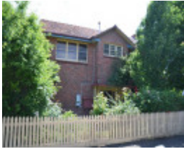
Figure 2: Nine Lot subdivision of land in Nantes Street (lot 8 - 31 Nantes Street is circled).