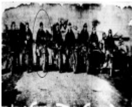
Figure 3: Geelong Annual Reliability Trial – Sporting Motorcycle Club, 1935 (Anderson is circled).