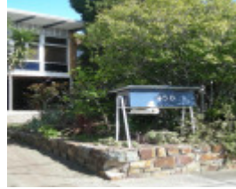
2017, front view with letterbox.JPG