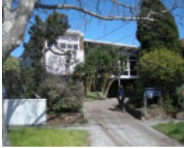
2017, front elevation.JPG