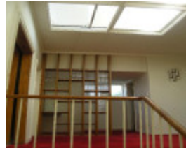
2017, upper level and skylight.JPG