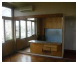
2017, main bedroom.JPG