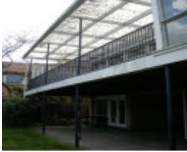
2017, rear deck a.JPG