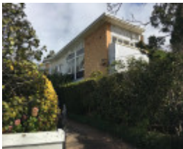
2017, east elevation.jpg