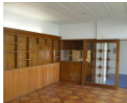
2017, living room.JPG