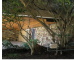
2017, main entrance.JPG