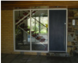
2017, main entrance door.JPG