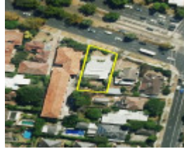
H2387 lind house air photo 16-01-2018.JPG