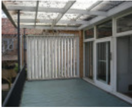
r2017, ear deck.JPG