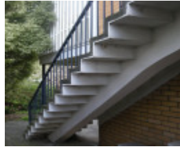
2017, rear stairs.JPG