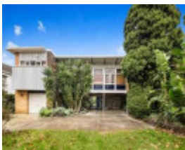
front elevation a.jpg