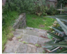
2017, rear garden.JPG