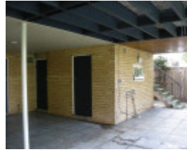
2017, below rear deck.JPG