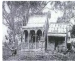
Joss House, undated.gif