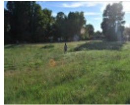
looking towards nth east corner 2017.jpg