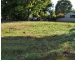
towards nth east corner 2017.jpg