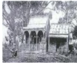
Joss House, undated.gif