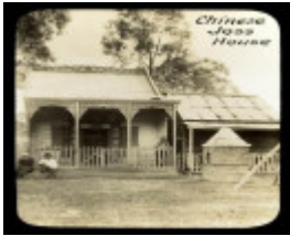
Joss House c1900s (SLV).jpg