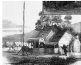
Chinese Joss House 1878 (Illustrated News).jpg