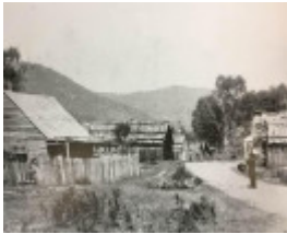
Bright Chinese Camp early 1900s.jpg