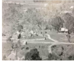
Bright Chinese Camp 1890.jpg