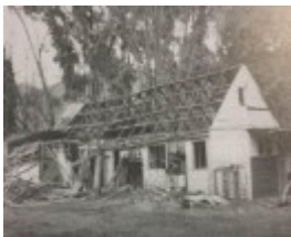
Quan Kee Hotel and Store c1970s.jpg