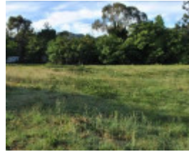
looking south 2017.jpg