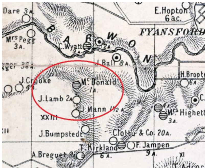
Figure 3: S.B. Bonney, Plan showing the Vineyards of the Geelong District, 22 September 1879. The blank circles represented healthy vineyards, the circles with horizontal lines represented vineyards that were not diseased but neglected, the circles with b