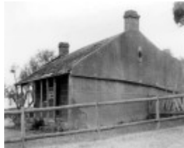
Figure 5: J.T. Collins, 'Barwonside', front and south elevations, c.1980-85.