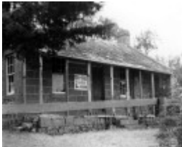
Figure 4: J.T. Collins, 'Barwonside', front view, c.1980-85.