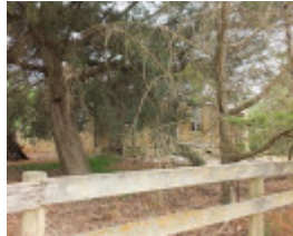
240 Gully Road, Ceres