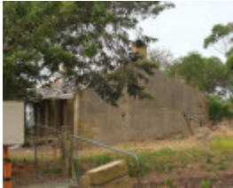
240 Gully Road, Ceres