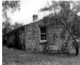
Figure 6: J.T. Collins, 'Barwonside', rear and north elevations, c.1980-85.