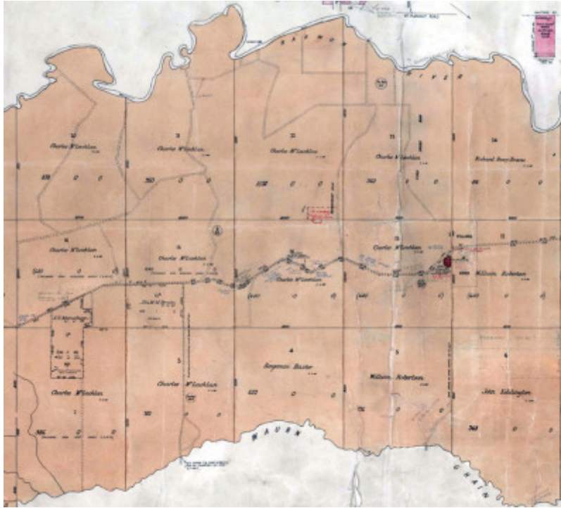
Figure 1: Part Barrabool Parish Plan, Dept of Lands & Survey, Melbourne, March 1946, showing land sections in the Barrabool Hills, including Ceres.