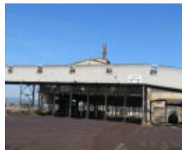
View south to briquette loading station.