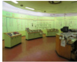
View inside the Power Station Control Room.