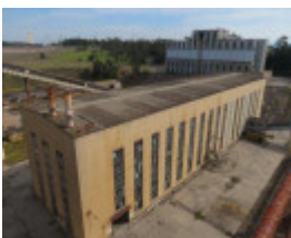
View southwest from the top of No.1 Briquette Factory looking at Wet Section No.1 building (foreground) with the raw coal bunker visible (background)