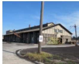
Briquette Storage Shed