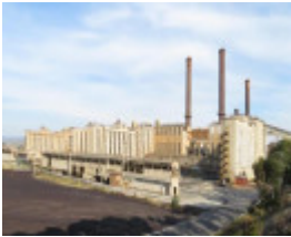
Morwell Power Station and Briquette Factories