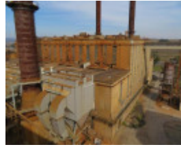
View south from the top of No.1 Briquette Factory looking at power station.