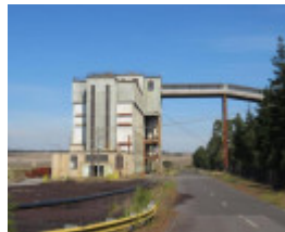
View south to the raw coal bunker and conveyor.