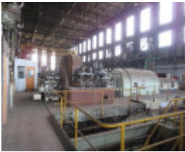
View inside the Turbine House, looking northeast.