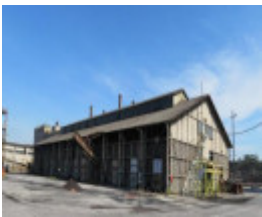
View southwest to Briquette Storage Shed.