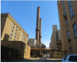
View looking west between Briquette Factories (right) and Power Station with chimneys 3 and 4 (left).