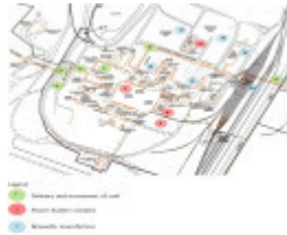
Site Map of Morwell Power Station Prepared 2017