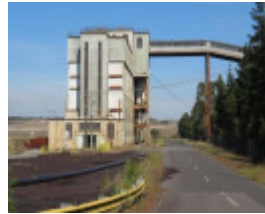
Raw Coal Bunker