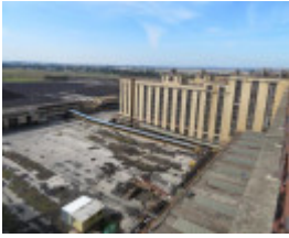
View northeast from the top of No.1 Briquette Factory looking at side of the Briquette Factory (right) and the collecting and feeding conveyors (left)