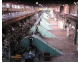
View of briquette machinery in No.1 Briquette Factory, looking east.