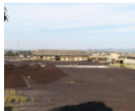
View east towards the briquette storage area, with the location of the former No.1 cooling tower in the middle, and the briquette storage shed in the background.