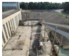
View east from the top of No.1 Briquette Factory looking at the conveyors and North West Corner Station.