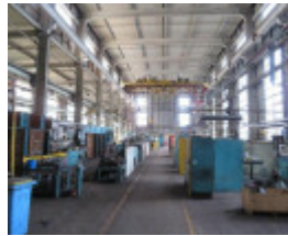
View inside the Mechanical Workshops, looking east.