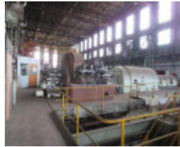
Wet Section Building