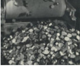
Loading briquettes for despatch, 1959.