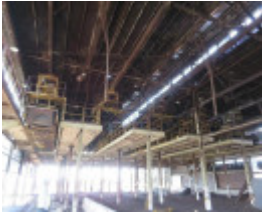
View from under the briquette loading station.