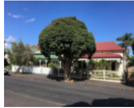
Tinning Street Precinct - nos. 145 & 147