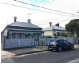
Tinning Street Precinct - nos. 110 & 112