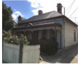
Tinning Street Precinct - no.98