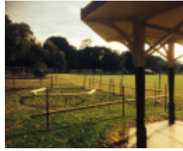
Before Photographs - Reference F3903 2015