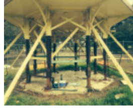
During Photographs - Reference F3903 2015