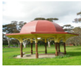
After Photographs - Reference F3903 2016