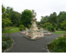
EASTERN PARK & GEELONG BOTANIC GARDENS SOHE 2008