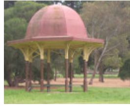
H2095 Eastern Park 29 10.2005 Former Ladies Kiosk