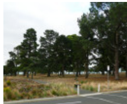
EASTERN PARK & GEELONG BOTANIC GARDENS SOHE 2008