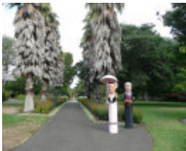
EASTERN PARK & GEELONG BOTANIC GARDENS SOHE 2008