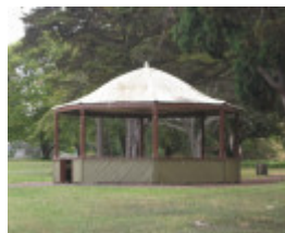
H2095 Eastern Park 10.2005 rotunda