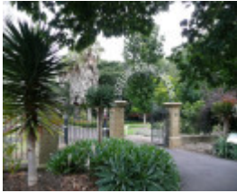
EASTERN PARK & GEELONG BOTANIC GARDENS SOHE 2008