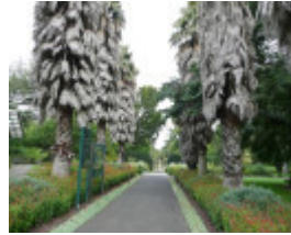
EASTERN PARK & GEELONG BOTANIC GARDENS SOHE 2008