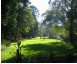
H2095 Geelong Bot Gardens 8.2005