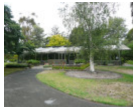
EASTERN PARK & GEELONG BOTANIC GARDENS SOHE 2008