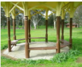
After Photographs - Reference F3903 2016