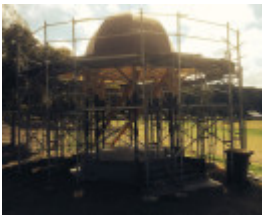
During Photographs - Reference F3903 2015