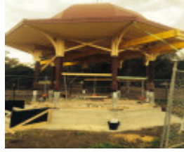
During Photographs - Reference F3903 2015