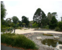
EASTERN PARK & GEELONG BOTANIC GARDENS SOHE 2008