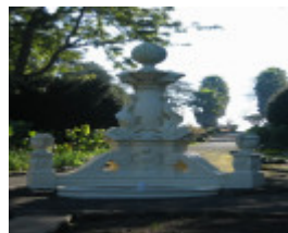
H2095 Geelong Bot Gardens 8.2005 Hitchcock Fountain