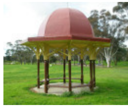
After Photographs - Reference F3903 2016