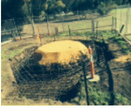
During Photographs - Reference F3903 2015