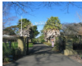
H2095 Geelong Bot Gardens 8.2005 Entry Gates