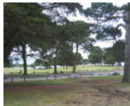
H2095 Eastern Park_10.2005