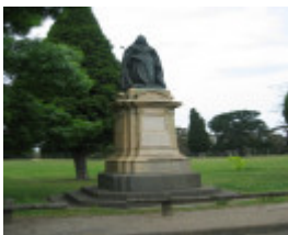
H2095 Eastern Park 10.2005 Queen Vic statue