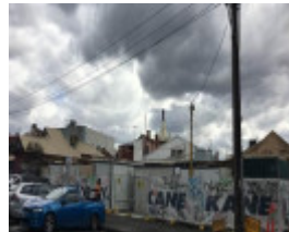
2017 rear view.jpg