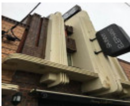
2017 1928 facade detail fins 2.jpg