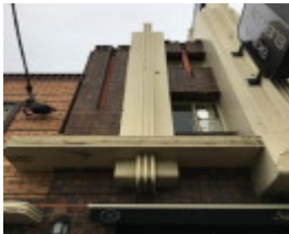
2017 1938 facade detail fins.jpg