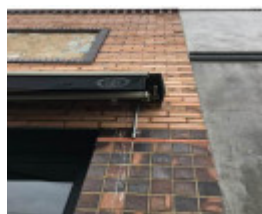
2017 1938 facade detail tiles.jpg