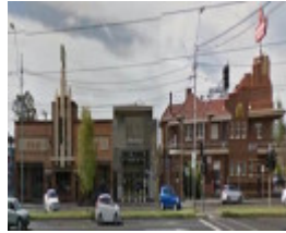
2017 street view.jpg