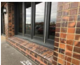
2017 1938 facade window opening.jpg