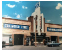
c1980s Tru-Mold Tyre Service.jpg