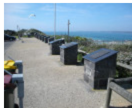
2018, Twentieth century memorials.jpg