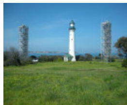
2018, Looking south-east_Murray tower on left_Hume Tower on right.jpg