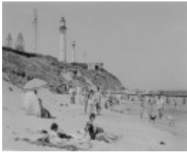
c.1960s from beach.jpg