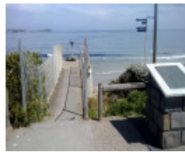
2018, Walkway to top of World War II bunker from carpark. .jpg