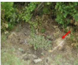
2018, Former location of the obelisk.jpg