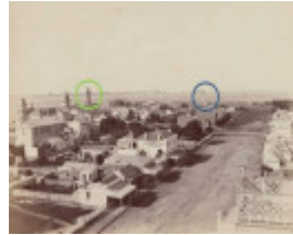
1890s view to Shortlands Bluff .jpg