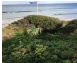
2018, Concealed see-saw searchlight bunker (1890s) on the southern boundary. .jpg