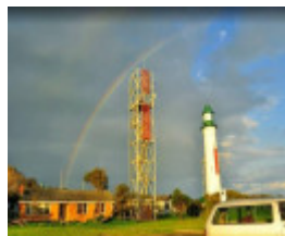
2010, Hume tower and white lighthouse.jpg