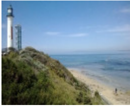
2018, Looking east .jpg