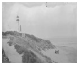
1920s looking east.jpg