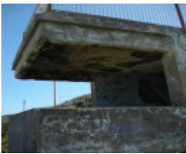
2018, World War II bunker on southern boundary.jpg