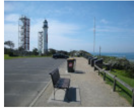
2018, Looking east _carpark.jpg