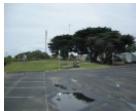
2018, Looking west to the bullring.jpg