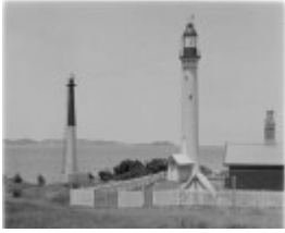
1920s_Obelisk and white lighthouse.jpg