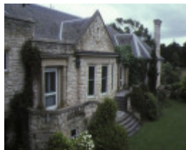
barragunda cape schanck road cape schanck new wing dec1984