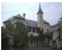
barragunda cape schanck road cape schanck rear view dec1984