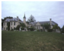
1 barragunda cape schanck road cape schanck view of property dec1984