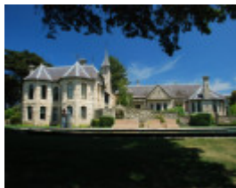
BARRAGUNDA SOHE 2008