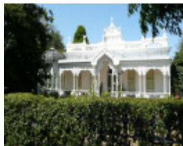
MIHARO SOHE 2008