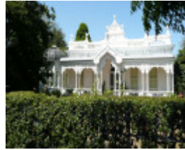
MIHARO SOHE 2008