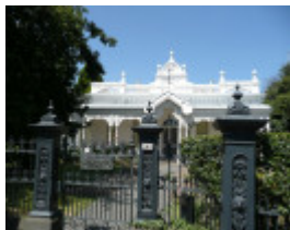
MIHARO SOHE 2008