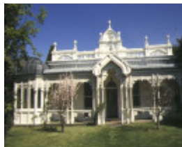
1 miharo noble street newtown front view sep1995