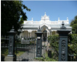
MIHARO SOHE 2008