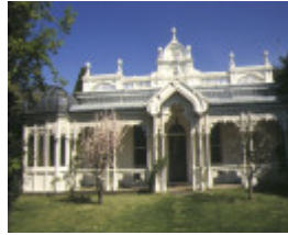
1 miharo noble street newtown front view sep1995