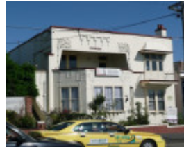
ST LEONARDS SOHE 2008