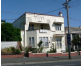
ST LEONARDS SOHE 2008