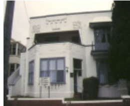
1 st leonards latrobe terrace newtown front view sep1995