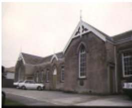
1 noble street uniting church hall & kindergarten noble street newtown kindergarten