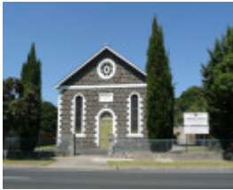
NOBLE STREET UNITING CHURCH, HALL AND KINDERGARTEN SOHE 2008