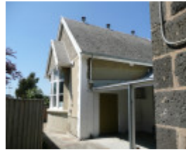
NOBLE STREET UNITING CHURCH, HALL AND KINDERGARTEN SOHE 2008