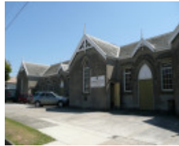
NOBLE STREET UNITING CHURCH, HALL AND KINDERGARTEN SOHE 2008