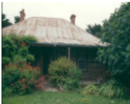
H01987 log cottage poowong front 2001