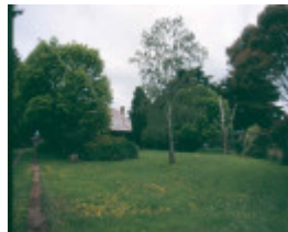
H01987 log cottage poowong hilltop position 2001