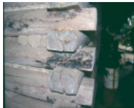
H01987 log cottage poowong corner detail 2001