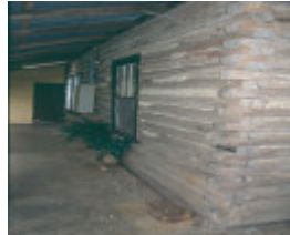
H01987 log cottage poowong east side 2001