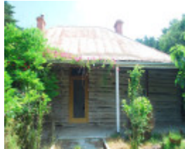
NOTCHED LOG COTTAGE SOHE 2008