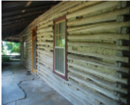
NOTCHED LOG COTTAGE SOHE 2008