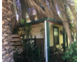
House, 18A Henry Street