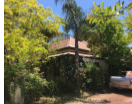
House, 18A Henry Street