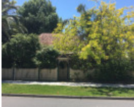
House, 18A Henry Street