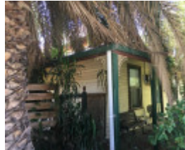
House, 18A Henry Street