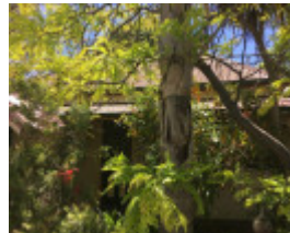
House, 18A Henry Street