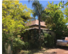
House, 18A Henry Street