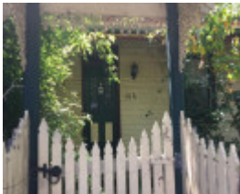
House, 18A Henry Street