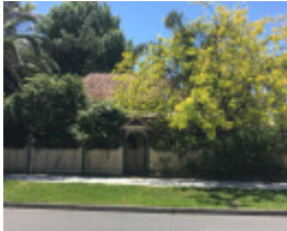
House, 18A Henry Street