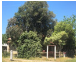
House, 39 Main Street