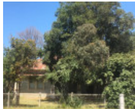
House, 39 Main Street