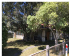
House, 39 Main Street