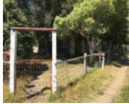
House, 39 Main Street