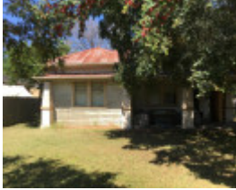
House, 39 Main Street