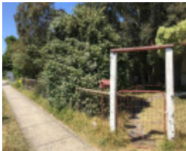
House, 39 Main Street