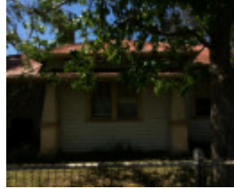
House, 39 Main Street